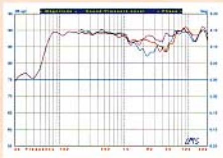
Fig. 4: Vienna Acoustics Oratorio, pseudo-anechoic vertical response at +15° (red) and -15° (blue) relative to tweeter axis.