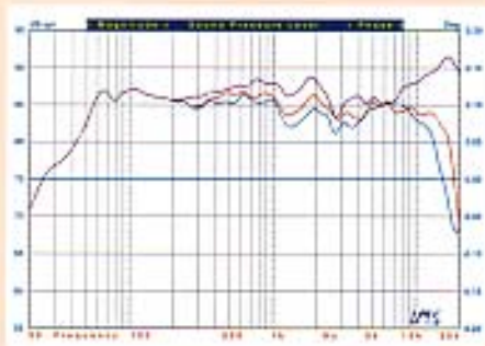
Fig. 1: Vienna Acoustics Strauss, pseudo-anechoic horizontal response at 45° (red) and 60° (blue) relative to tweeter axis.

Like the Strauss, the ported loading of the Oratorio is atypical, making precise interpretation of its loading frequency difficult. I would rate its nominal impedance at 4Ω; the minimum impedance was 2.4Ω at 78Hz. The sensitivity measured approximately 89dB/W/m; its overall impedance characteristic suggests that, like the Strauss, the Oratorio should be moderately difficult to drive—acceptable for many well-designed, separate amps but unsuitable for receivers, most of which are uncomfortable with low-impedance loads.