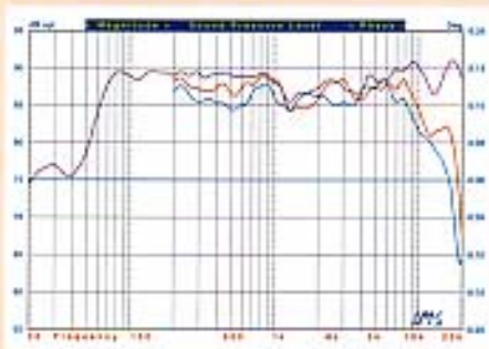
Fig. 3: Vienna Acoustics Oratorio, pseudo-anechoic horizontal response at 45° (red) and 60° (blue) relative to tweeter axis.

All figures: Violet: Pseudo-anechoic response on tweeter axis, averaged across a 30° horizontal window, combined with nearfield responses of woofer and port.