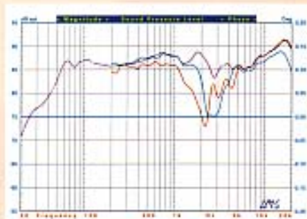
Fig. 2: Vienna Acoustics Strauss, pseudo-anechoic vertical response at +15° (red) and -15° (blue) relative to tweeter axis.

The Oratorio's ±15° vertical off-axis performance (Fig. 4) shows that the speaker performs best on-axis, with positions above the axis less detrimental than those below.—Thomas J. Norton