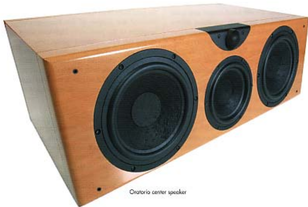
Oratorio center speaker

real-world home-theater environment than my downstairs megabucks room. The home-theater space is contained within a larger room that also includes my kitchen and living room. The entire space measures 24x29 feet, with a phalanx of 6-foot-high ASC Tube Traps defining the rear boundary of the smaller, 14x15 feet home-theater area. These traps also provide an ideal place to situate rear speakers. Other acoustical elements include a row of ASC wall treatments evenly spaced on the front wall, six randomly spaced Ceiling Clouds, an ASC Shadowcaster outside each speaker, and a thick 7x5 oriental rug, all of which help damp the home theater's room acoustics. The final results make for an ideal area to enjoy a film on a direct-view or rear-projection monitor.