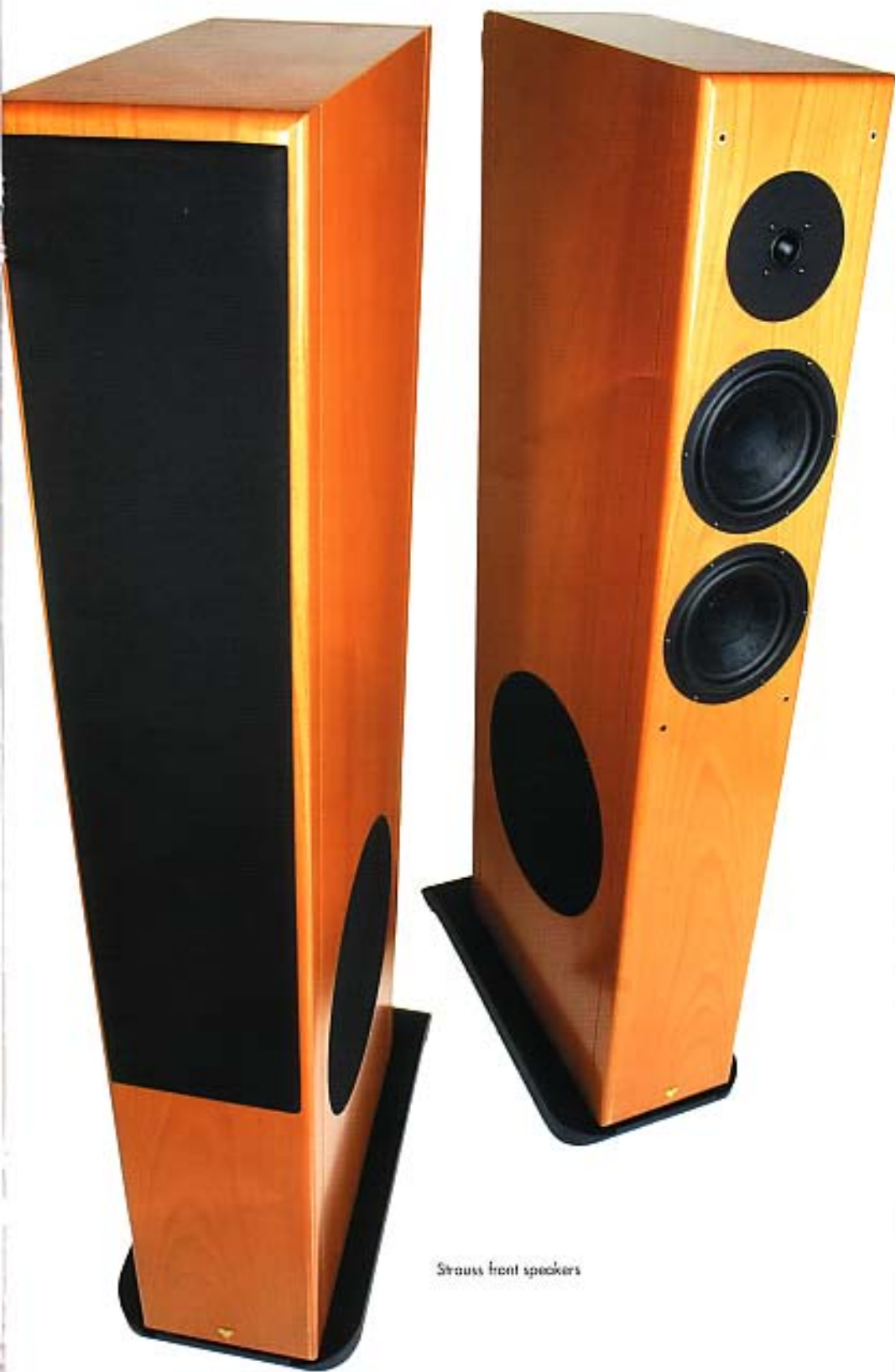
Strauss front speakers

The principal drawback of the Strauss is its size. These large speakers simply will not fit, sonically or visually, into a small screening room. By "small," I mean anything with dimensions under about 15 feet. You could try to fit them into less space, and they'll never sound actually bad, but you can't expect optimum performance if you have to shoe-horn them into a tiny room. Since my upper-level screening area was part of a much larger space, I was able to experience most of what the speakers had to offer. One of VA's smaller speakers would be more appropriate for smaller rooms.