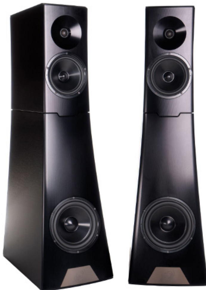
Vantage™ in Black

Please contact YG Acoustics for more information.