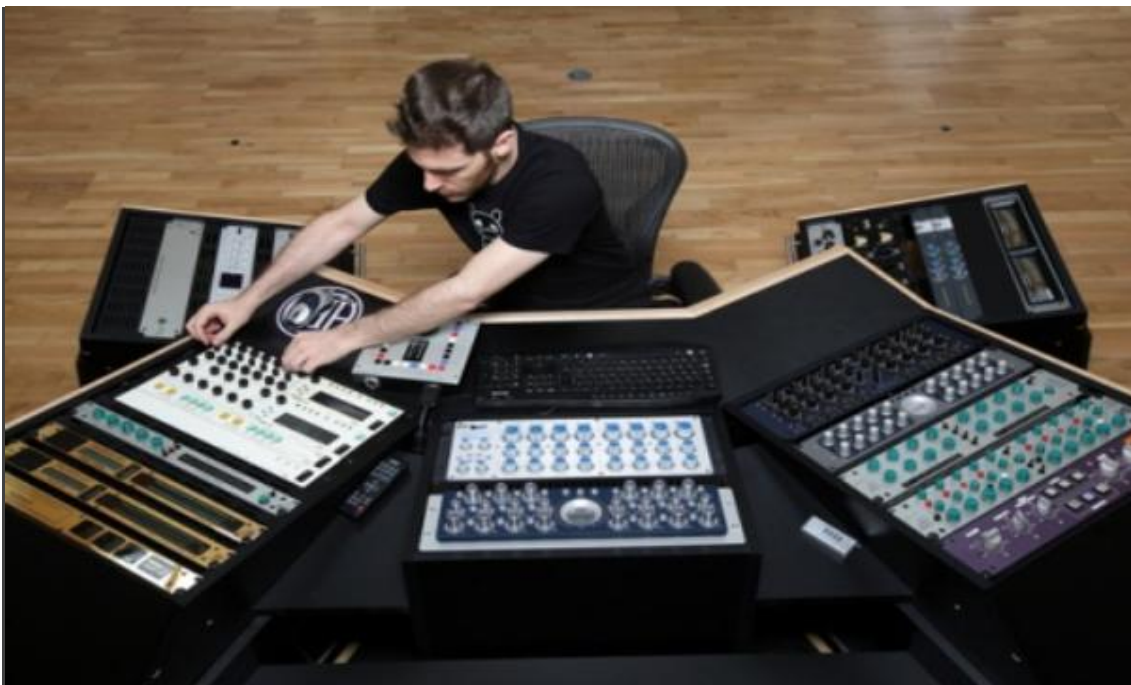
Weiss Gambit Series used by the world's most renowned mastering studios.

In the case of our Series 5 units, which support various signal processing algorithms (DSP), Roon always reflects the currently active signal path unique to our Series 5 units. We think that appropriate DSP can enhance the listening experience to a great extent. We design the DSP algorithms such that they are very user-friendly to control. Our company designs DSP equipment for professional Mastering Studios, meaning that we know how to achieve high quality signal processing.