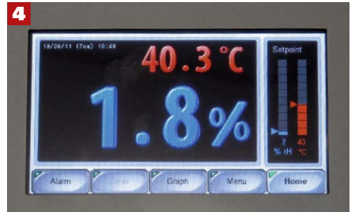
1 At the start there is a bath of salt water: 90 seconds at 300 volts and 250 amps. 2 In a second step, any residues of water are removed by alcohol and the parts are dried. 3 After drying, the copper contacts are perfectly clean. 4 In the climatic chamber the contacts wait for their gold coating.

chemistry and acid bath, instead using a plasma mist of gold atoms. These are released from a solid gold block by electron bombardment of a strong microwave radiation, then pass through a vacuum and finally settle on the copper parts guided by a magnetic field. This is supposed to deliver more direct, better structured and denser results than possible with electroplating, allowing a thin coating with an explicitly homogeneous surface. WBT currently speaks of 600 to 800 atomic