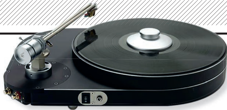
ABOVE: The Simplicity II tonearm wires can be terminated via block connections with DIN/RCA/XLR sockets or direct wired phono (RCA) leads which cost extra. Rocker switch next to its charger input caters for standby/off/charge settings

flustered. With the Thales taking charge there's no sense of it being in anyway overwhelmed by the track's complexity. Instead it seems to revel in the challenge, going beyond simply pulling out all the musical detail, and presenting it with a cohesion that brings it all together as the recording engineers intended.