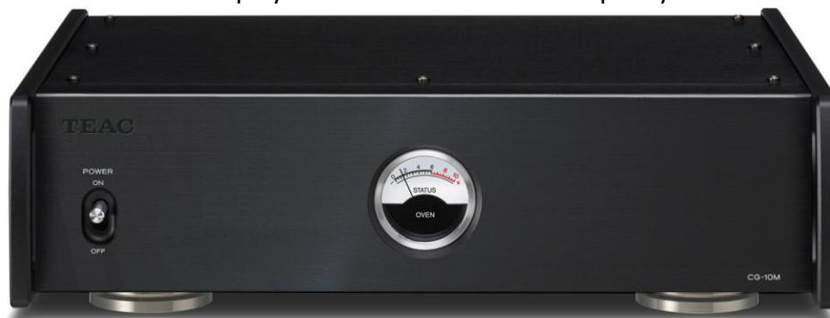
Option TEAC CG-10M/CG-10M-A clock generator

In addition, an external 10MHz clock input is also provided, to synchronize with an even higher-precision master clock generator, such as the TEAC CG-10M/CG-10M-A, for yet further upgraded audio playback with excellent sound quality.