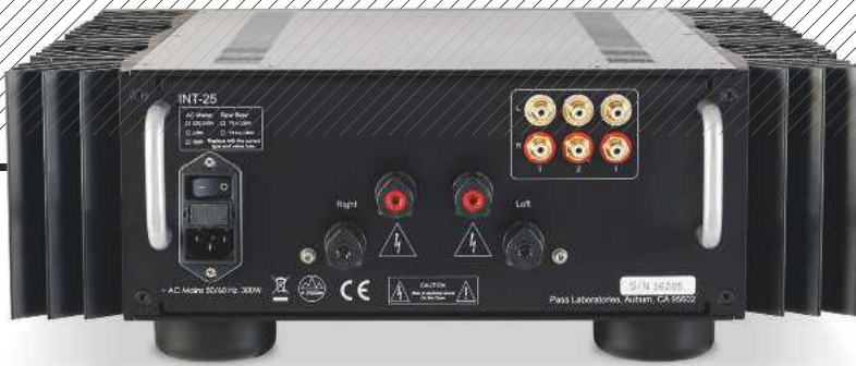
ABOVE: As simple as it gets – just three single-ended line inputs on RCAs and substantial 4mm speaker cable binding posts. The handles are largely decorative!

and had violin and harpsichord notes dancing from my speakers. I wouldn't really describe it as an up-and-at-'em performance, for this integrated is too even-handed to ever be considered rowdy. Yet nor is it frustratingly polite. The dynamic peaks and troughs of Pramsöhler's playing demand an amp with a deft touch and transient ability – and, via the INT-25, that's what they got.