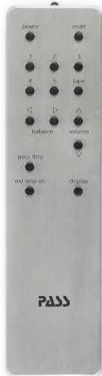
LEFT: Not all buttons on Pass Labs' system remote are in use for the INT-25 – just '1, 2, 3' for input selection, up/down volume, mute and power on

Regards power, the INT-25 had the subjective grunt to never sound like it was straining with my floorstanders. Swapping them for some Q Acoustics standmounts, and ignoring the price difference between amp and speakers, it made the compact cabinets sound substantially bigger than they are. The amp's character – energetic but not aggressive, musical and deliciously detailed – still shone through, so it's hard to imagine it not forming a formidable partnership with anything but the most needy of loudspeakers. ☺