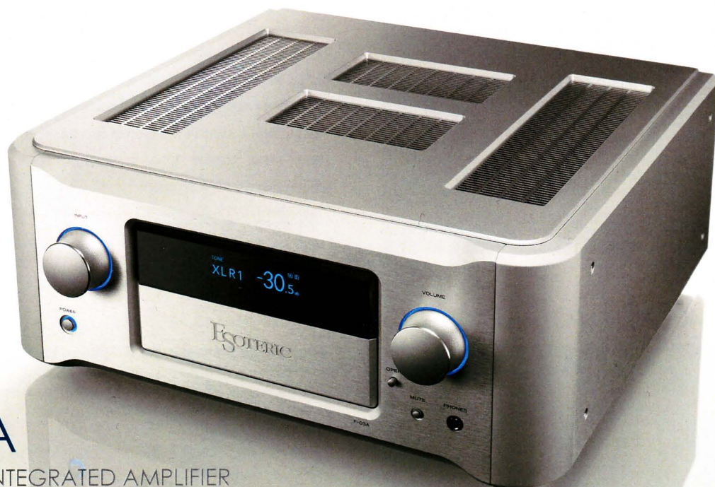
F-03A CLASS A INTEGRATED AMPLIFIER