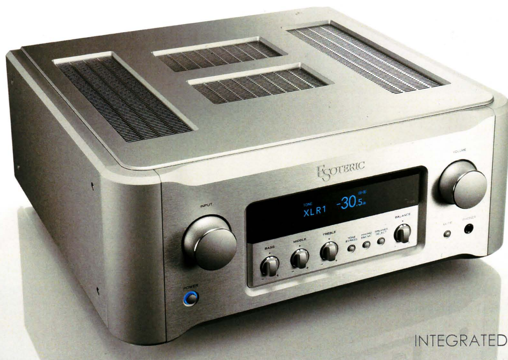
F-05 INTEGRATED AMPLIFIER