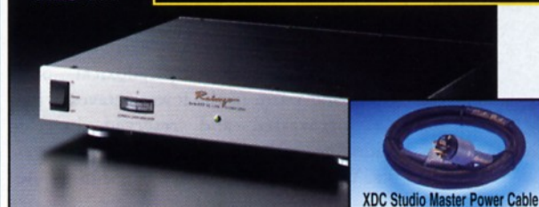
XDC Studio Master Power Cable