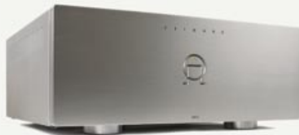
A30.5 Five Channel Power Amplifier