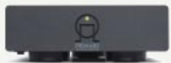
R20 MM-MC Amplifier

PRIMARE PRODUCTS ARE AVAILABLE IN TWO FINISHES - BLACK AND TITANIUM