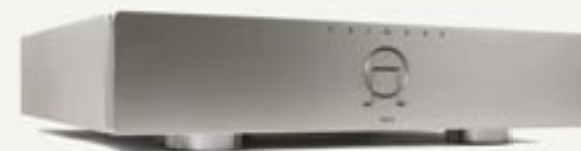
A30.3 Three Channel Power Amplifier