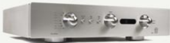
PRE30 Stereo Preamplifier