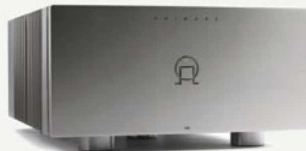
A32 Two Channel Power Amplifier