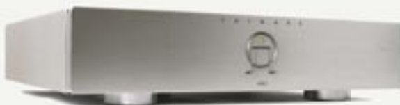
A30.2 Two Channel Power Amplifier